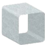
SHS / RHS

20 x 20 x 2 - 100 x 100 x 5 / 30 x 20 x 2 - 140 x 80 x 4