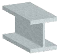
Beams and Channels (UPN)